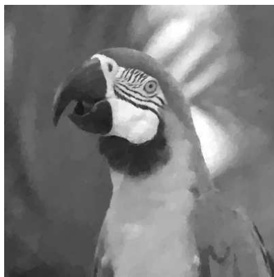
denoised with the TV