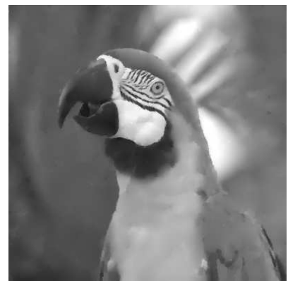
denoised with the TGV ( \mu = 2 )